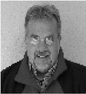
Region Safety Administrator