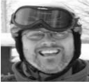
Region Senior S&T Administrator