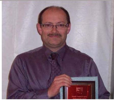
Granite Peak, Outstanding Large Alpine Patrol