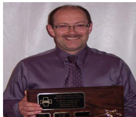
Granite Peak Senior Participation Award