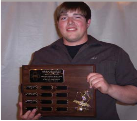
Navarino Slopes, Banquet Participation Award