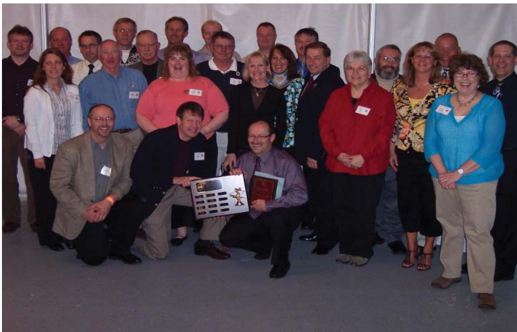
Granite Peak Patrol Members Pose with Senior Participation Award and Outstanding Large Alpine Patrol Awards