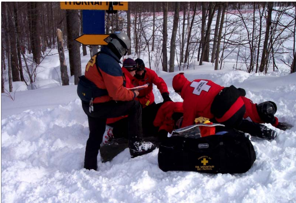
Senior Candidates demonstrate their emergency management skills in realistic conditions such as the scenario above. Applications for this year's Senior Candidates is December 1, 2009.

If you think you might be interested in taking that next step in learning and becoming a senior check out the Senior Manual on the Central Division website. http://www.nspcentral.org/senior.php