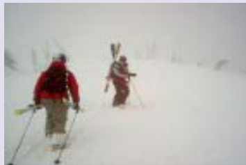
Photo depicts future Granite Peak PR Les Robinson back country skiing in Montana in what was reported to Powder Lines as the "unusual position of actually being upright." Who would report such a thing?

Special Photo Submission By a NC Section Chief