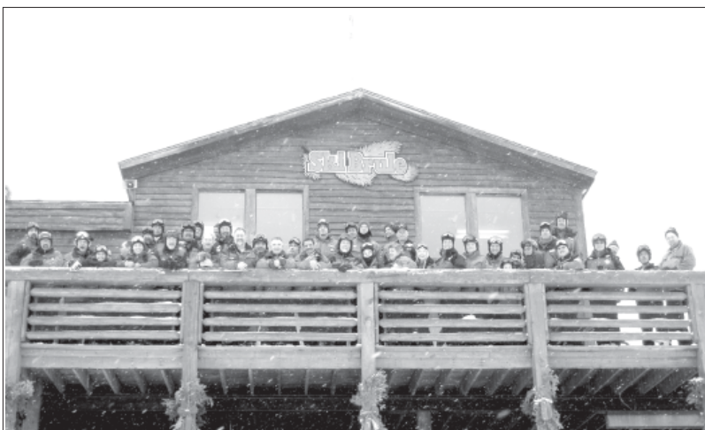
Participants at the 2008 "Best Ski Training Event Ever" pose for a photo outside the chalet at Brule. See additional photos from this year's event on page 6.

The event was registered as a Toboggan Enhancement Seminar and should show up on your records after being processed by the National Office. Best wishes for a great finish to the Patrolling Season!