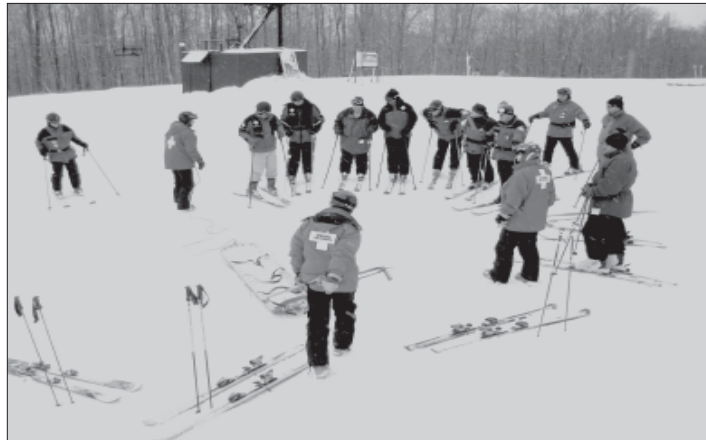
Instructors provide on hill instruction to patrollers. Here one group is receiving final instructions prior to working with toboggans to refresh and improve toboggan handling skills.