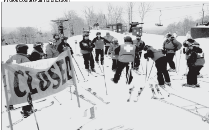
Once again this year, Ski Brule generously hosted the NC Region Ski and Toboggan Clinic. Fifty-four region members participated in the event designed to enhance patroller S&T skills.