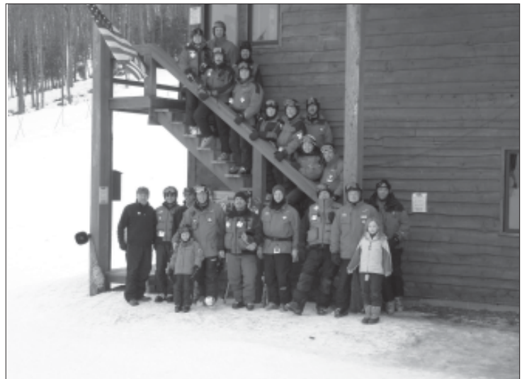
Twenty four patrollers attended the North Central Region S & T Enhancement Clinic held January 13 at Ski Brule. The group poses here following a day of play and education in the snow.