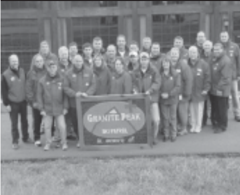
Members of the Granite Peak Ski Patrol pose together after being named Central Division Outstanding Alpine Patrol and also receiving a citation from the National Award Committee.