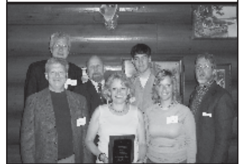
Outstanding Small Alpine Patrol: Navarino Slopes Ski Patrol