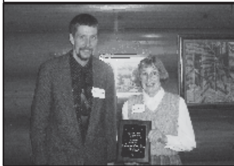
Outstanding Nordic Patrol: Minocqua Winter Park