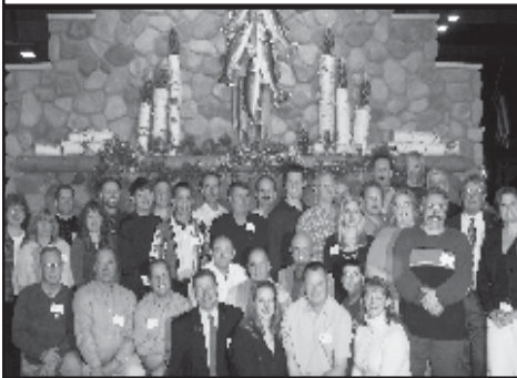
Outstanding Large Alpine Patrol: Granite Peak Ski Patrol