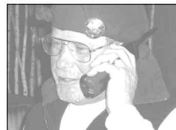
When festivities moved from the banquet area to the bar, this member of the French ski patrol was spotted phoning in suggestions gleaned from North Central patrollers.