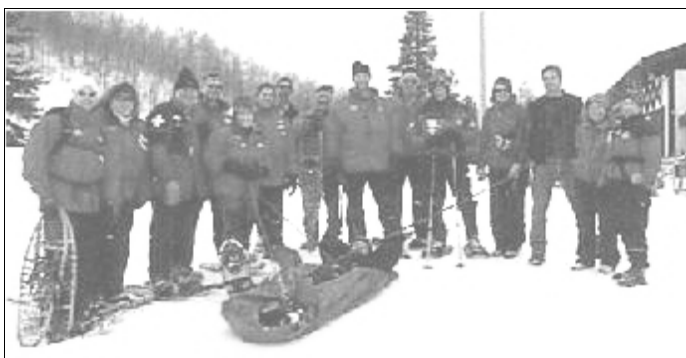
Class members pose following a simulated rescue at Minocqua Winter Park during MTR Fundamentals Training. Another MTR Fundamentals class is scheduled for December. See registration form on page 8.