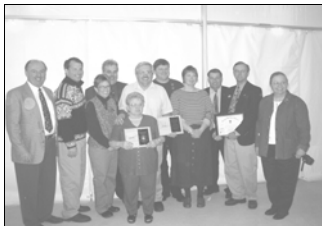
Members of the Marquette Mountain Ski Patrol accept the Outstanding Large Alpine Patrol Award for 2004.